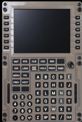
Boeing 757 Boeing 767